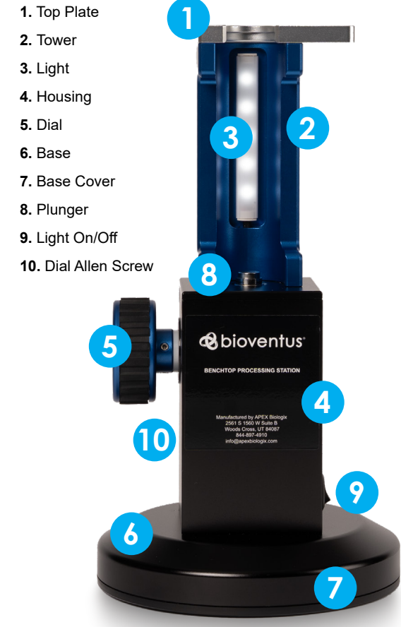
Figure 1: BPS Device

Caution: Do not use acetone, caustic detergents, or detergents that contain chlorite ions, hydroxide, silica, or phosphates, which can corrode the anodize coating of the BPS and/or cause oxidation. Do not use steel wool, metal tools, wire brushes or other abrasives as they could likewise damage the anodize coating.